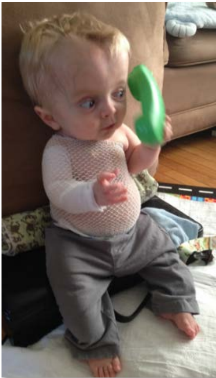
Right arm is supported with a soft cotton wrap and held to the body with Surgilast

Upper Arm Bone: Support the arm against the body, limiting motion as much possible ( See photo ). For an effective temporary sling, simply pin the sleeve of a long-sleeved shirt to the shirt body above and below the wrist and at the elbow.