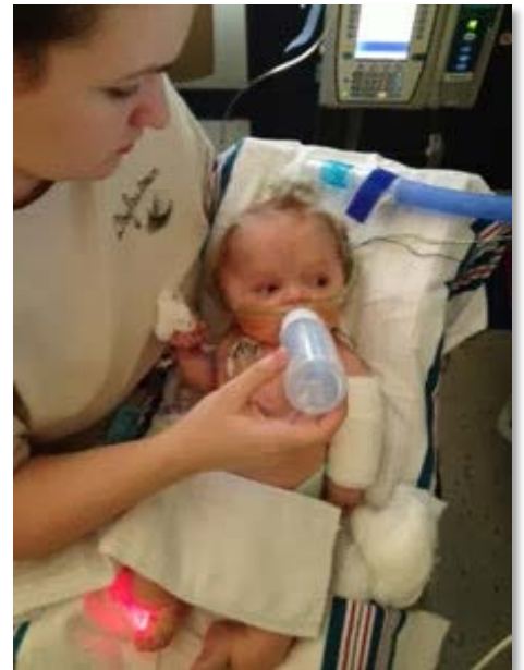
A soft cotton wrap immobilizes the left arm

Thigh Bone: A broken leg can often be protected (especially for sleeping) by simply placing a small folded hand towel between the child's legs and wrapping both legs together with an elastic bandage or gauze wrap. The towel will prevent chafing and will lend some rigidity to the legs. Or, cut an oval piece of cardboard that is 4 to 5 inches wide and as long as the child's thigh from hip to knee (or from hip to ankle). Bend it to curve around the leg, cupping the bone like a cast. Pad the cardboard with soft fabric or a blanket. Wrap an elastic bandage or gauze roll loosely around the cardboard brace.