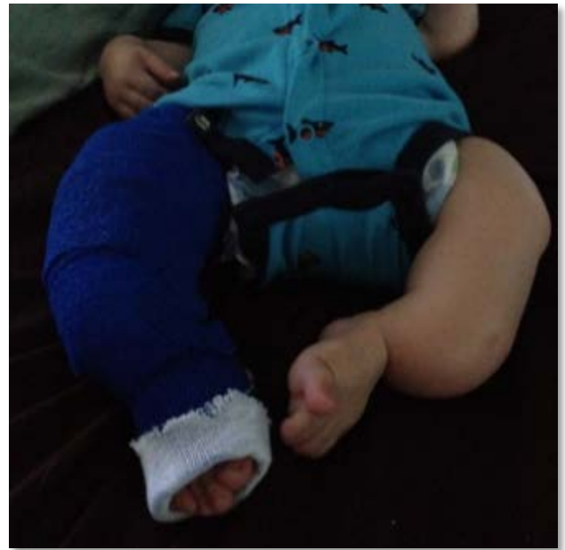
Example of a home splint for the right leg

Wrapping is most easily accomplished by two people, one of whom wraps and one of whom holds the leg. When wrapping with an elastic bandage or gauze roll, roll the bandage on without stretching it to allow for swelling. Leave the toes exposed and frequently check for color changes that indicate a lack of circulation. Watch also for any swelling and color changes in the splinted limb. A deep pink or red color indicates that the splint is too tight; the first step would be to loosen the wrap.